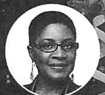
Broward County District 9 Commissioner Hazelle P. Rogers