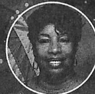
Royal Palm Beach Councilwoman Sylvia Sharpe